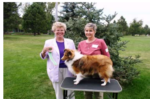
Best in Sweeps at B/OB Match Amadeus Gold Dust Woman