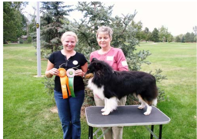
Best of Breed at B/OB Match—Kambria First Glance